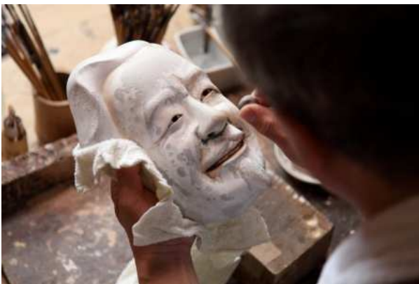
Simon Starling, Project for a Masquerade (Hiroshima) , 2010 (detail)