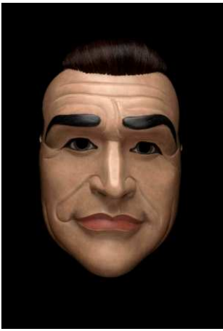
Simon Starling, Project for a Masquerade (Hiroshima) , 2010 (detail)

Installation with masks, tripods, film and screen. Image shows one of the masks, of Kichiji, The Gold Merchant (modeled on Sean Connery's depiction of James Bond).