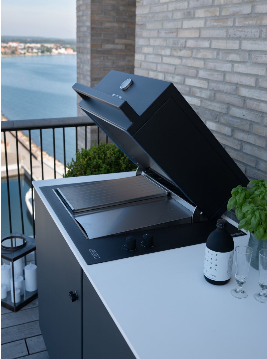
MODUL 3 IN ANTHRACITE GREY