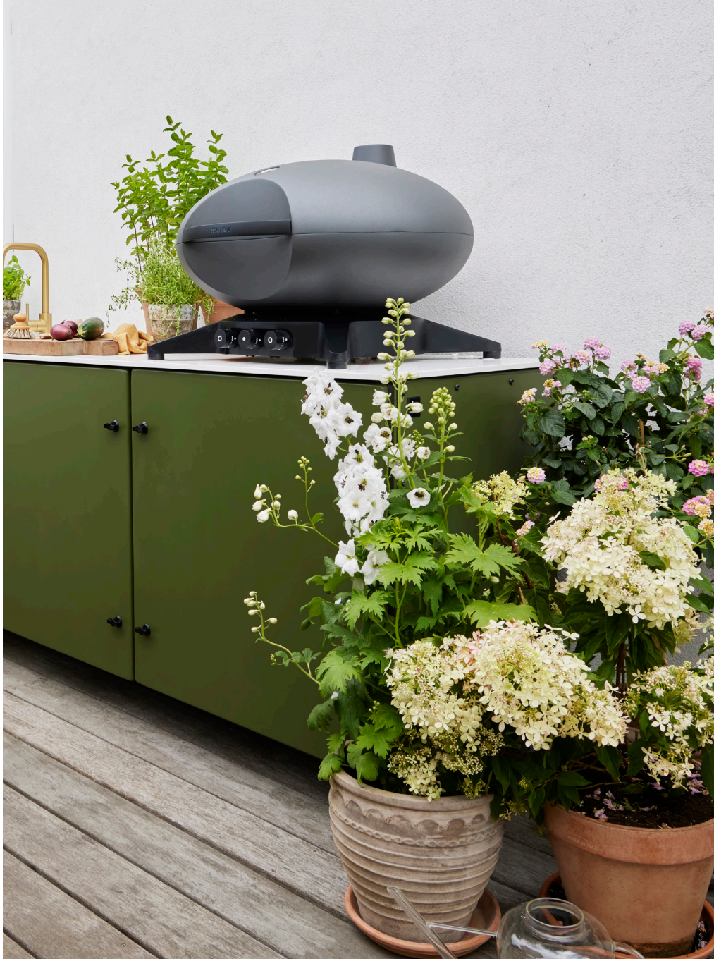
MODUL 3 IN OLIVE GREEN

PERSONALIZED OUTDOOR KITCHEN THAT PERFECTLY SUITS YOUR TASTE.