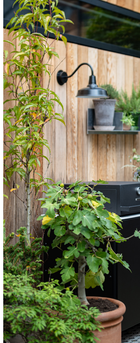
MODUL 3 IN JET BLACK