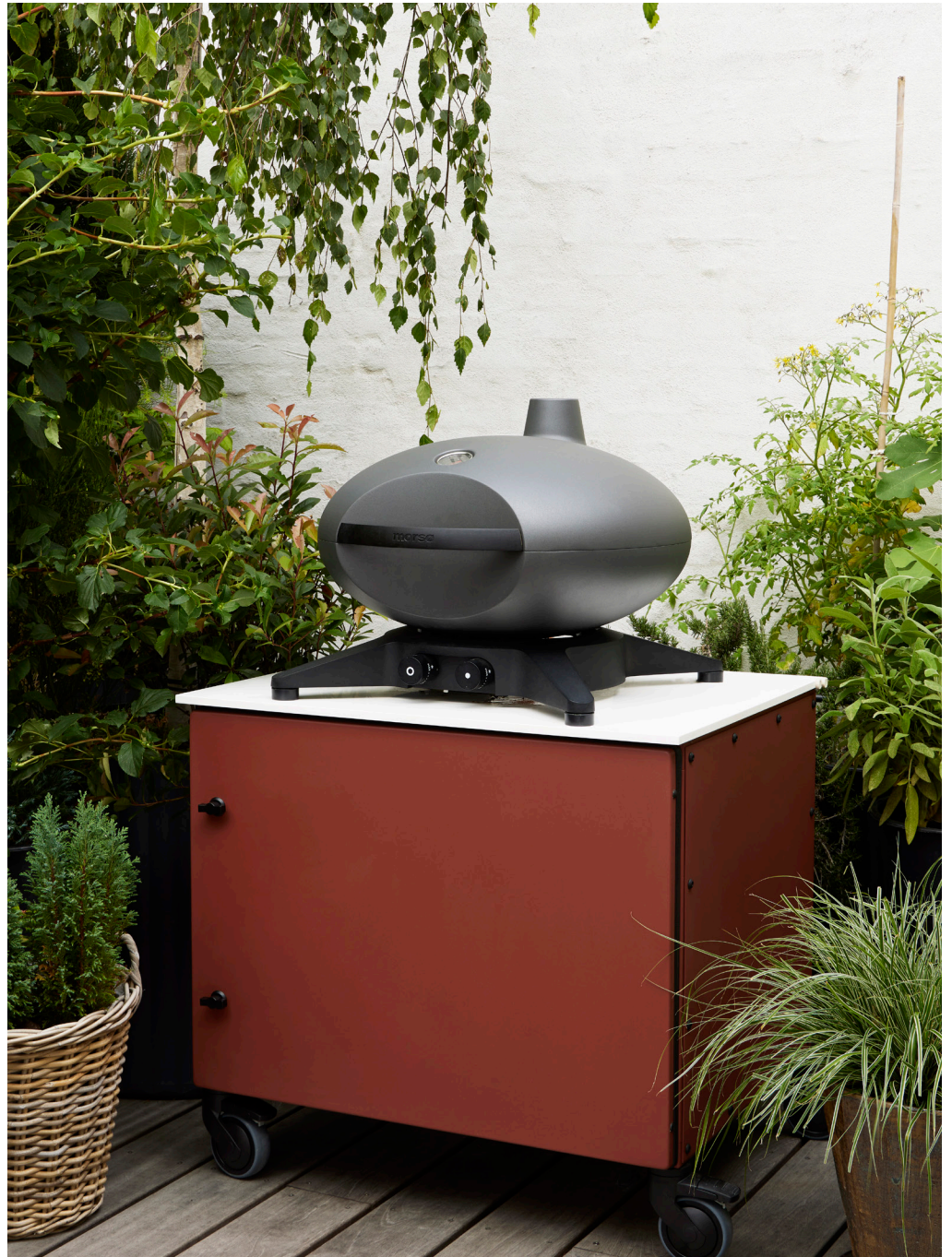
GRILL CABINET IN OCHER RED

Norrvik outdoor kitchens are designed to complement any style, offering a palette that ranges from timeless neutral tones to vibrant, eye-catching colors. Whether you envision an elegant, understated look or a bold, dynamic statement, our versatile color selection empowers you to create a personalized outdoor kitchen that perfectly suits your taste.