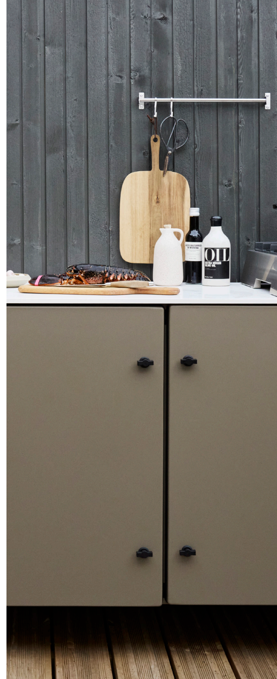
MODUL 3 IN TAUPE GREY