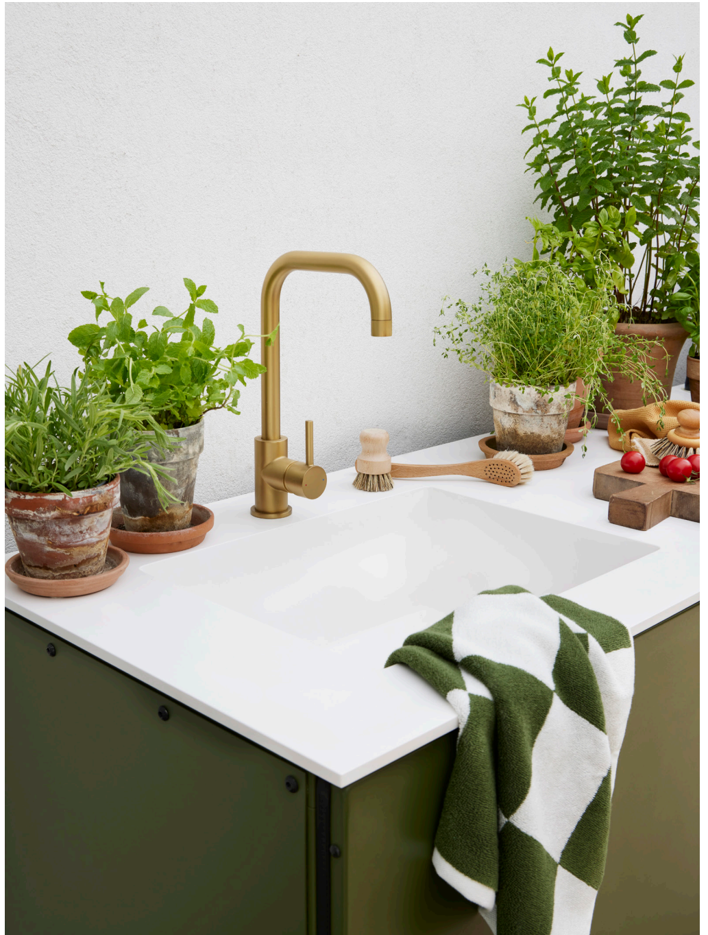
MODUL 2 OLIVE GREEN

For those looking to elevate their outdoor kitchen with a distinct and stylish touch, Terrazzo countertops are available, providing the same exceptional quality and versatility as our composite options.